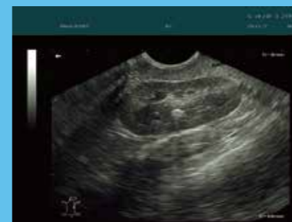
Canine Renal Stone