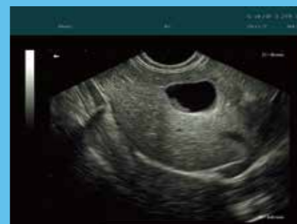
Canine Gall Bladder